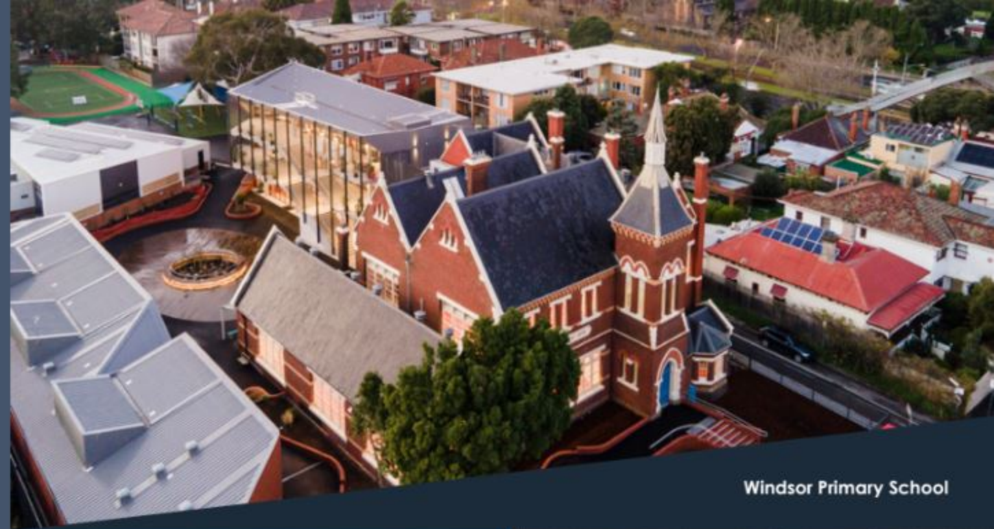
Windsor Primary School

Construction of new junior school education wing, new supply to school, MSB and metering facilities. Light, power, UPS and certified comms installation Completed Dec 2020