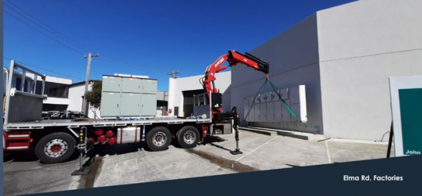
Elma Rd. Factories