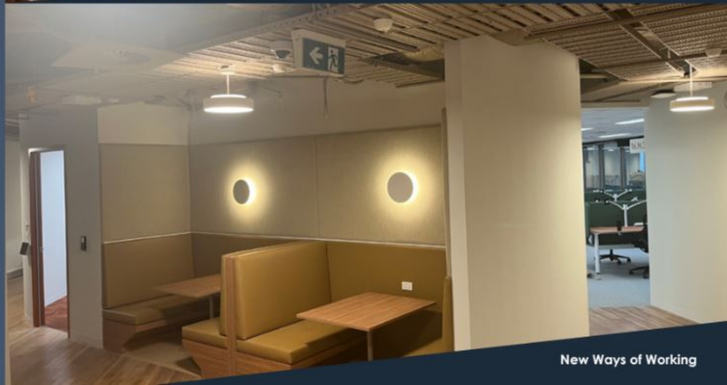
New Ways of Working