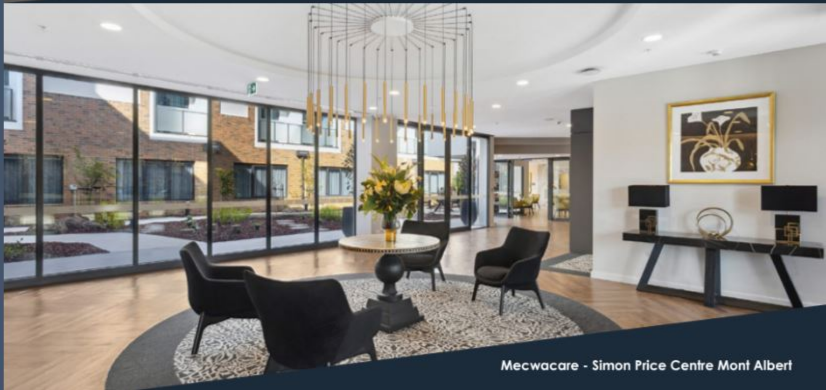
Mecwacare - Simon Price Centre Mont Albert