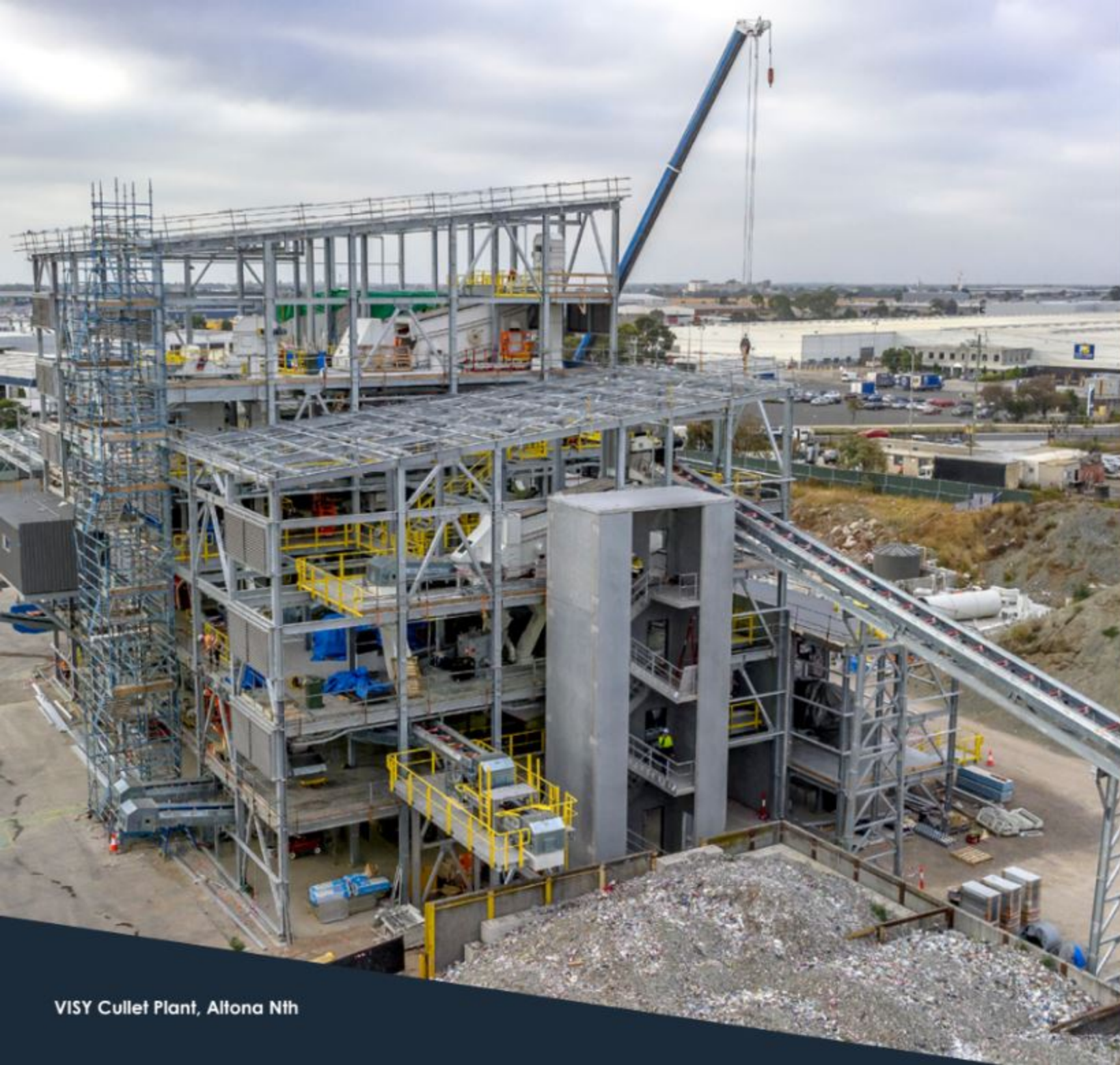
VISY Cullet Plant, Altona Nth