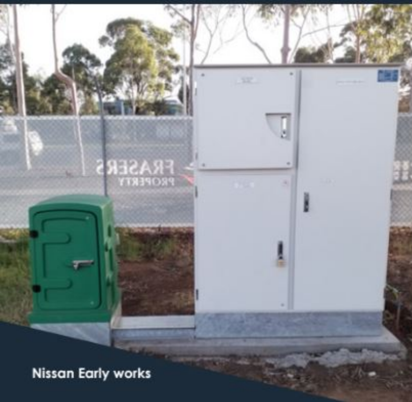
Nissan Early works