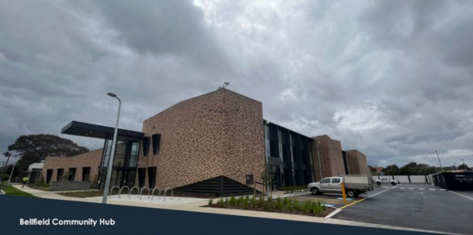
Bellfield Community Hub