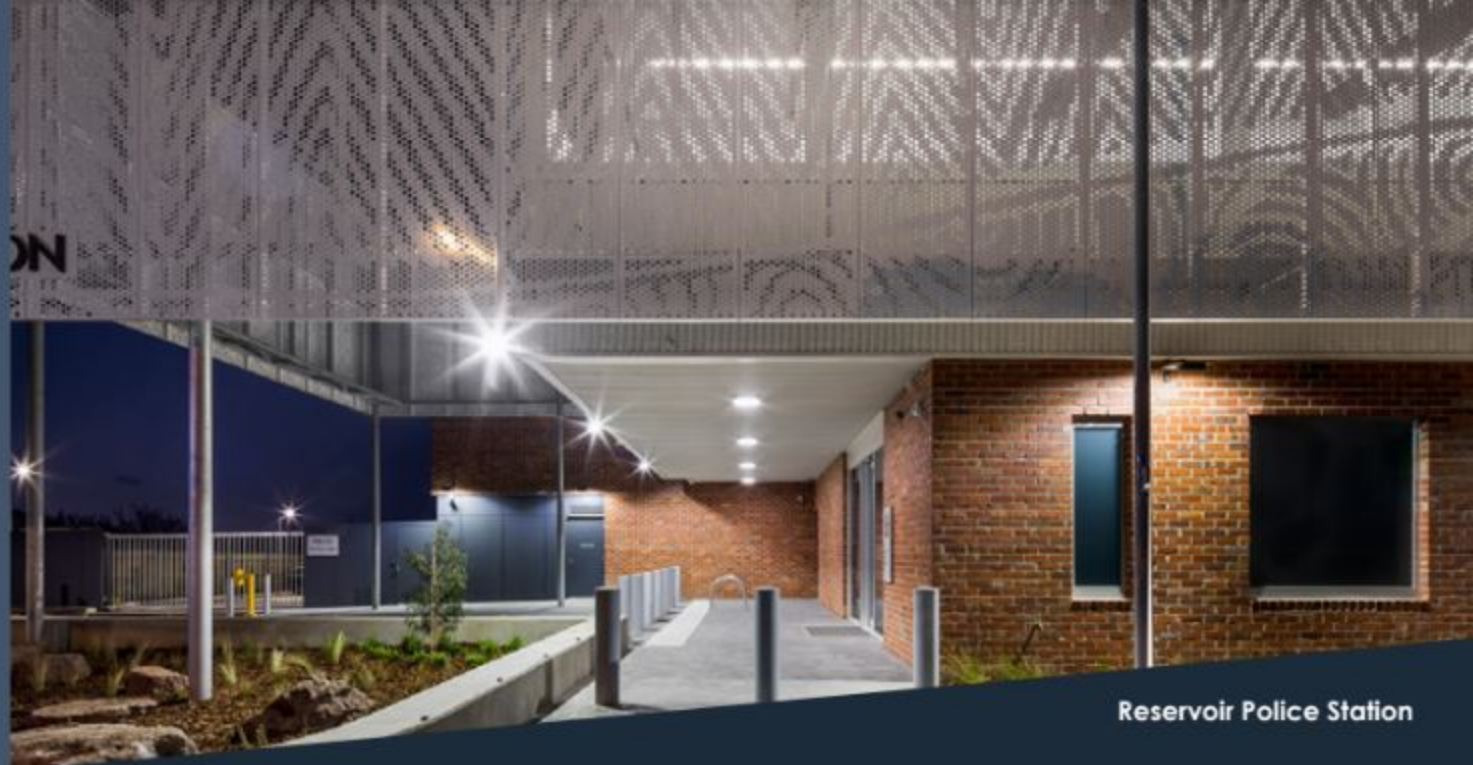
Reservoir Police Station

Refit of barracks and amenities. Light and power, new DB, in-house dry fire. Completed September 2022