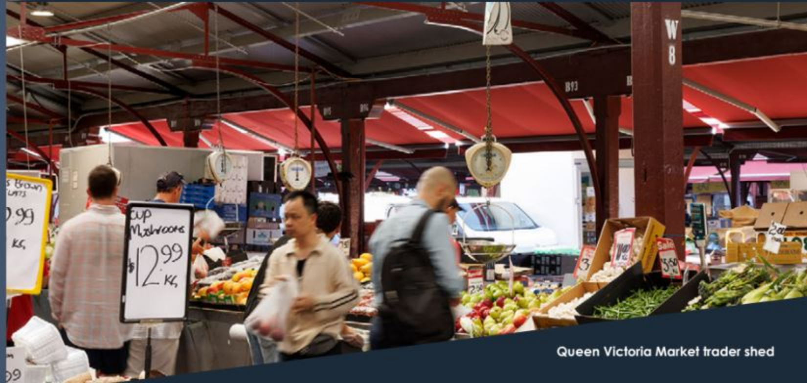
Queen Victoria Market trader shed