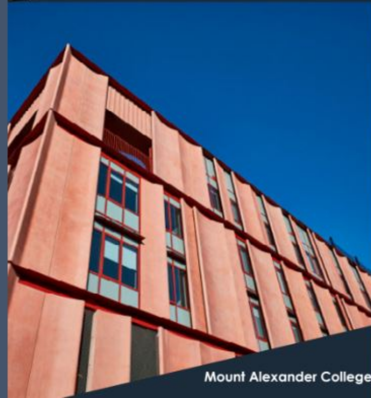
Mount Alexander College