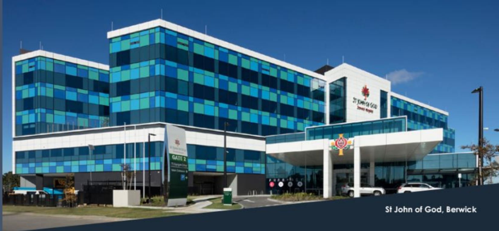
St John of God, Berwick

Nurse call system installation to hospital refurbishment and extension. Completed Mar 2022