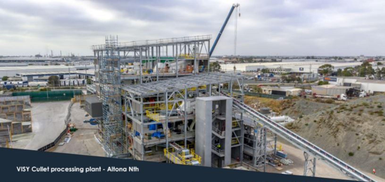
VISY Cullet processing plant - Altona Nth